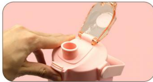
1 One button cover opening