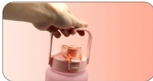
3 Convenient handle